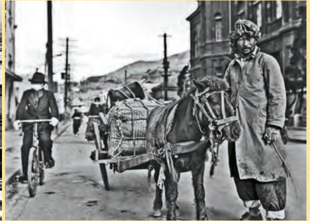
The only motorized transportation on Seoul streets in the year after World War II ended were army vehicles and public buses.

me as an enemy. The country, the churches and even the common people were all trying to get me. How does one survive in those circumstances? If I had opposed them with force, they would have destroyed me. I had no other choice but to sacrifice myself for them and serve them. Even if they hit me ten times, I begged God to bless them. Even if I were treated with contempt a thousand times, I was determined to pray for them. I silently watched and overcame everything, thinking, This year contains a thousand years' worth of resentment.