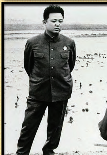
Communism held a natural appeal for oppressed Koreans; it took root after the March 1919 uprising failed to free Korea from colonial domination. Kim Il-sung (left) returned from the Soviet Union to lead North Korea in 1945. Right: Students in Pyongyang carry portraits of Kim Il-sung and Josef Stalin on a march celebrating November 3, 1946 elections for the North Korean People's Committee, the first step in forming a separate, North Korean, government. (North and South still used the same flag.)